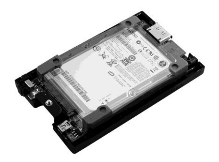
Step 5 Mount the board to the bottom cover.